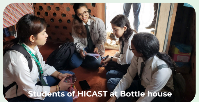
Students of HICAST at Bottle house