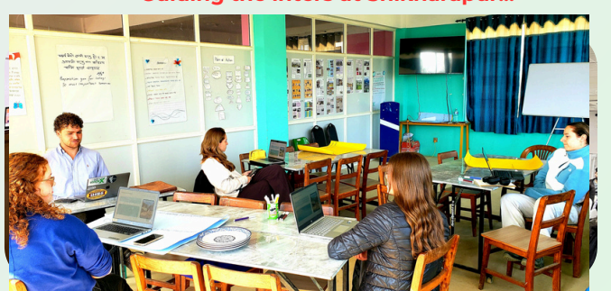
Students at work, WHC, Netherlands at ALRC