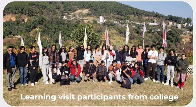
Learning visit participants from college