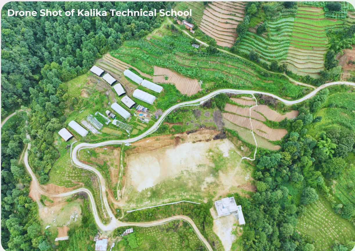
Drone Shot of Kalika Technical School

Kalika Secondary School is excited to partner with the Shikharapur CLC-ONGD-FNEL project. This partnership will help improve agricultural education and create valuable opportunities for students and the community.