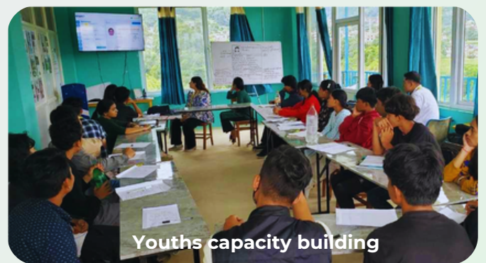
Youths capacity building