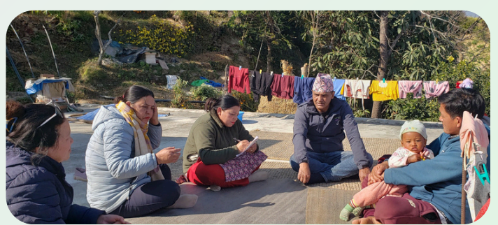
Field Visit and monitoring of Matching Grant Recipient Farmer, Simpani