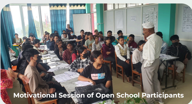
Motivational Session of Open School Participants