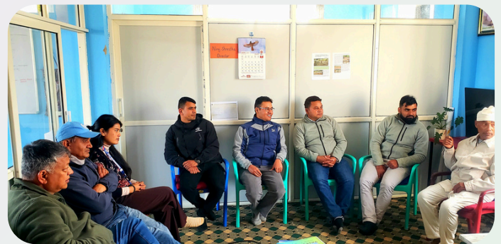
Team of Share and Care Nepal at SCLC