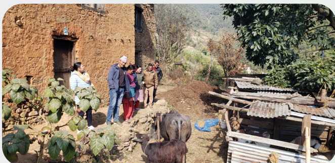
Field Visit and monitoring of Matching Grant Recipient Farmer, Talku