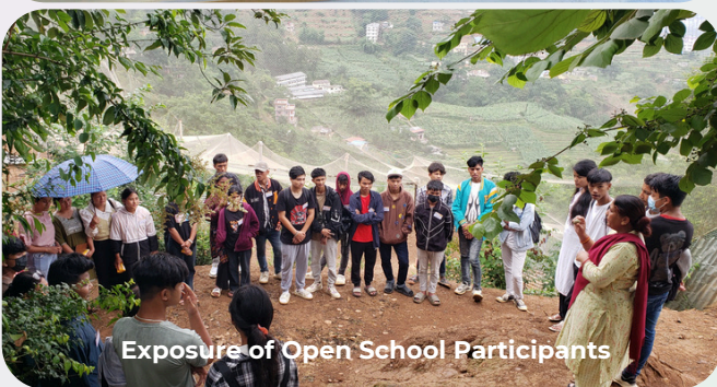
Exposure of Open School Participants