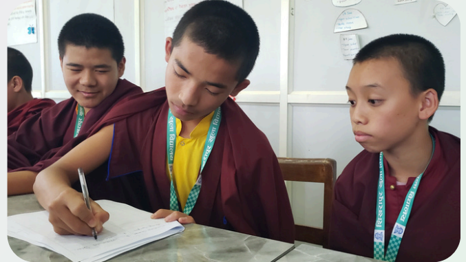
Monks in Open School