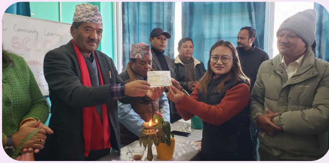
Shikhrapur CLC supports Champadevi Open School