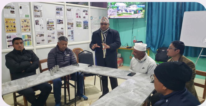
Chairperson of Dupcheshowr Rural Municipality at SCLC