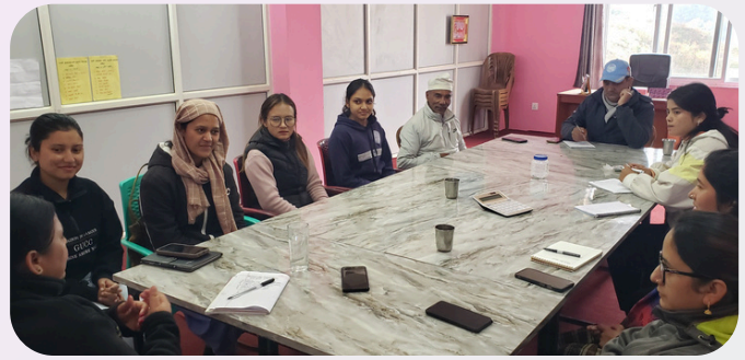
Regular meeting of SCLC/Open School