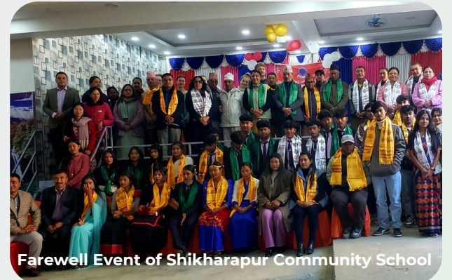
Farewell Event of Shikharapur Community School