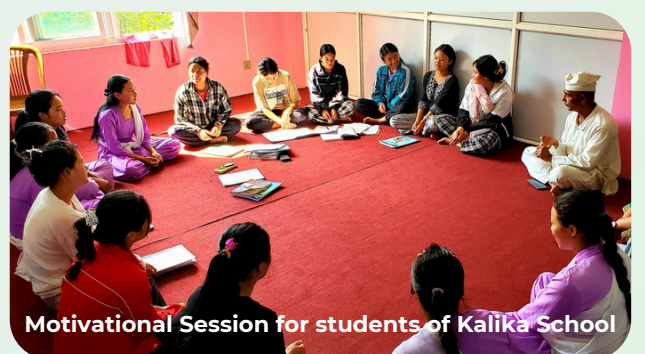
Motivational Session for students of Kalika School