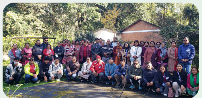
SCLC Beneficiary Team at ICIMOD, Godawari