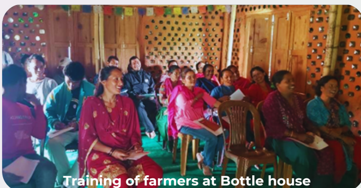
Training of farmers at Bottle house