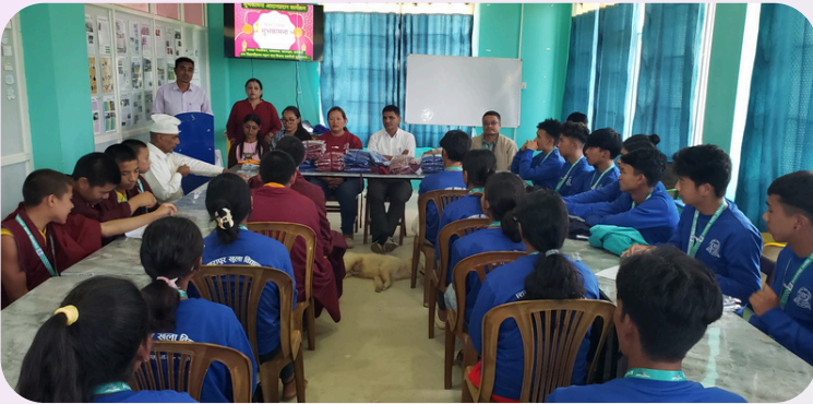
Training of Open School Participants