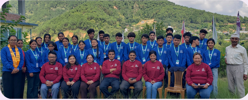
Open School Participants