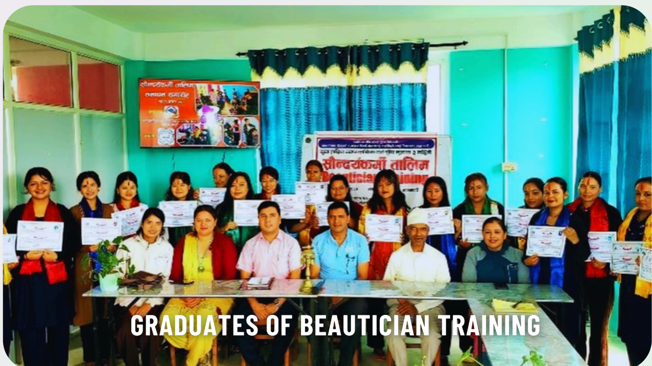
GRADUATES OF BEAUTICIAN TRAINING

The training was held at the Agricultural Study Resource Center building in Shikharapur.