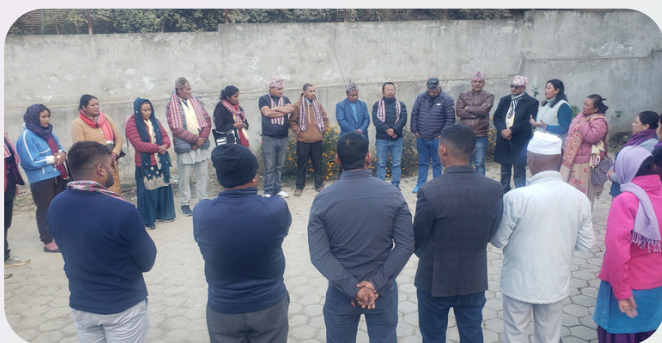
Visitors Team from Dupcheshowr Rural Municipality at SCLC