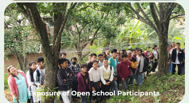
Exposure of Open School Participants