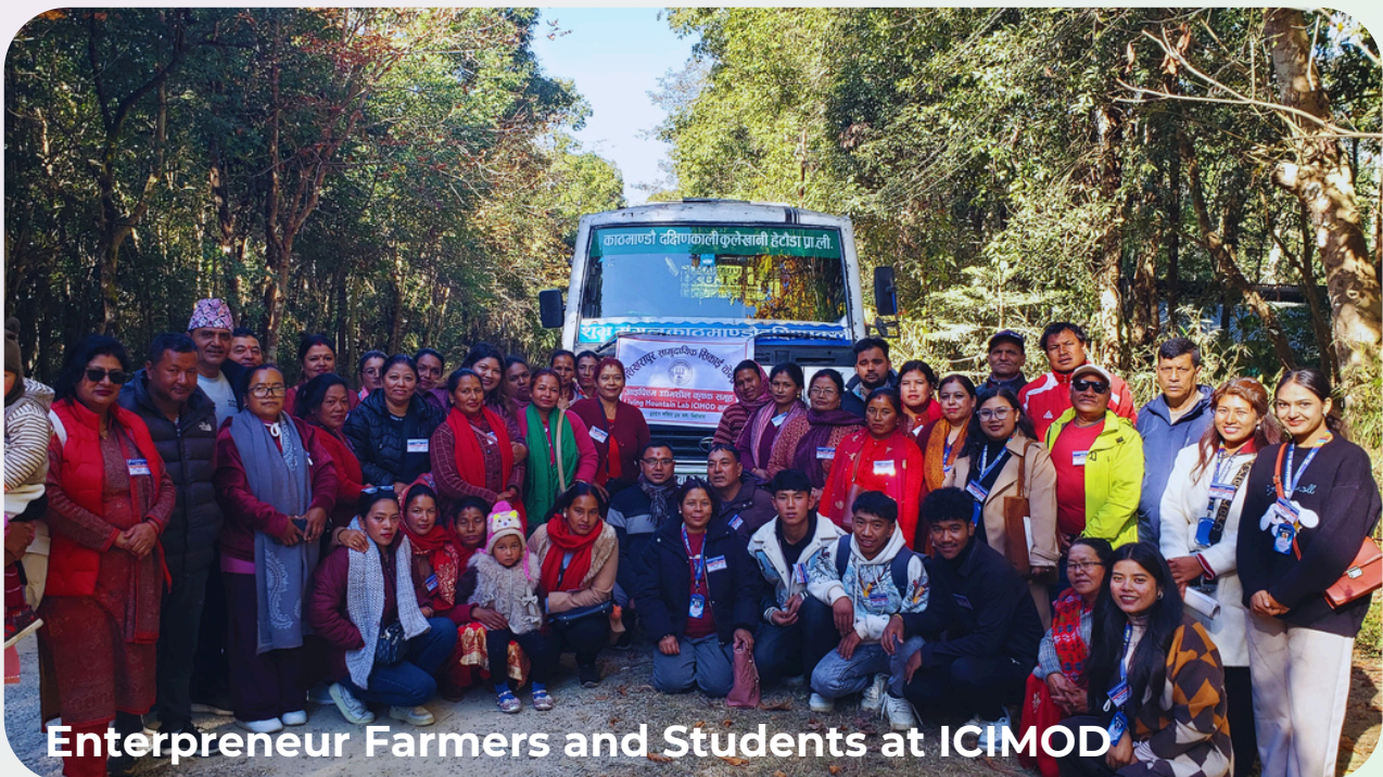
Entrepreneur Farmers and Students at ICIMOD

Participants also explored biodiversity, plastic-free environments, and techniques for farming on sloped terrains.