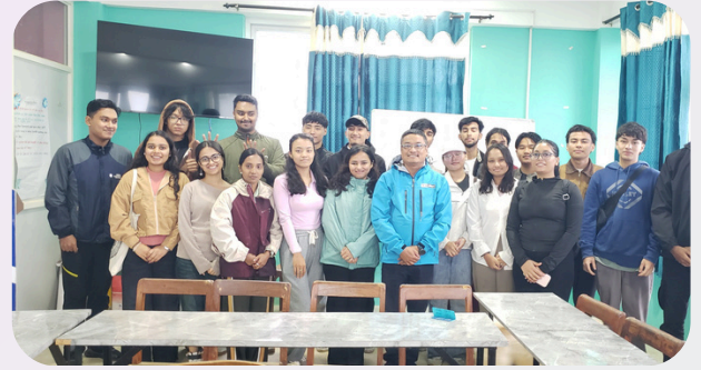
Visitor Students from Thames International College