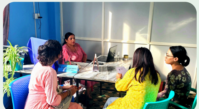
Guiding the inters at Shikharapur...