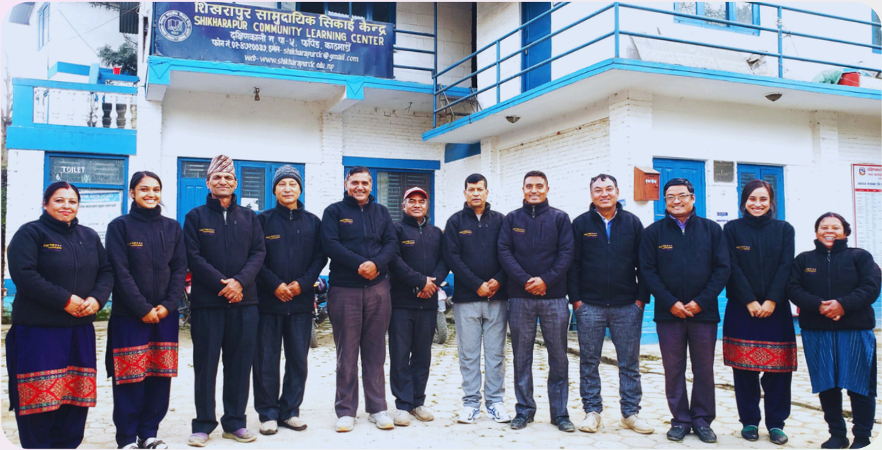
Photo: Board Members & Staff