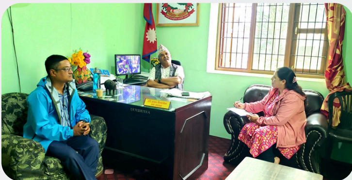
Key Informants Interview- Ward no. 7 Chairperson