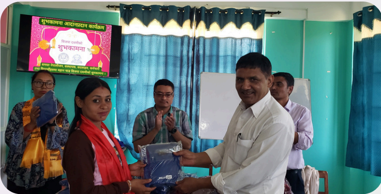
Facilitating Top Student of Open School