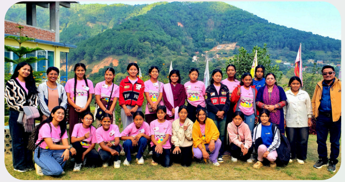
Girls Empowerment Exchange Visit from Hamro Palo