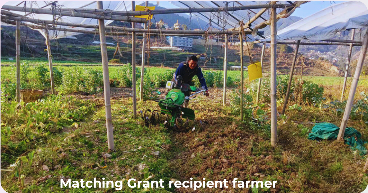
Matching Grant recipient farmer

THIS IS THE DARPANGATHA'S PHOTO WALL REFLECTING THE SUCCESSFUL STORIES THAT ARE EMBROIDERED IN SCLC.