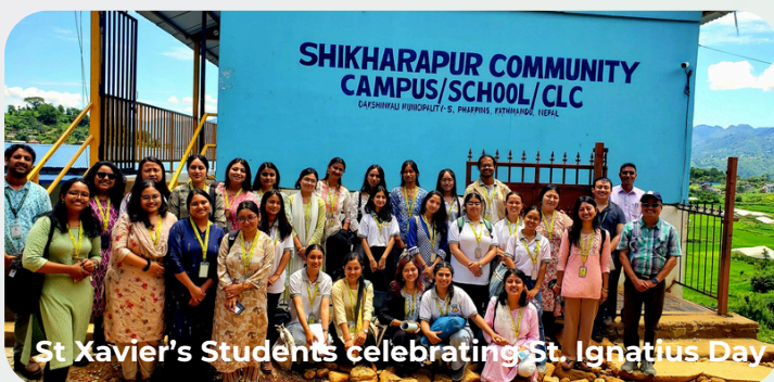
St Xavier's Students celebrating St. Ignatius Day