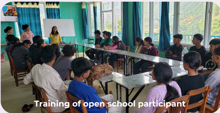
Training of open school participant