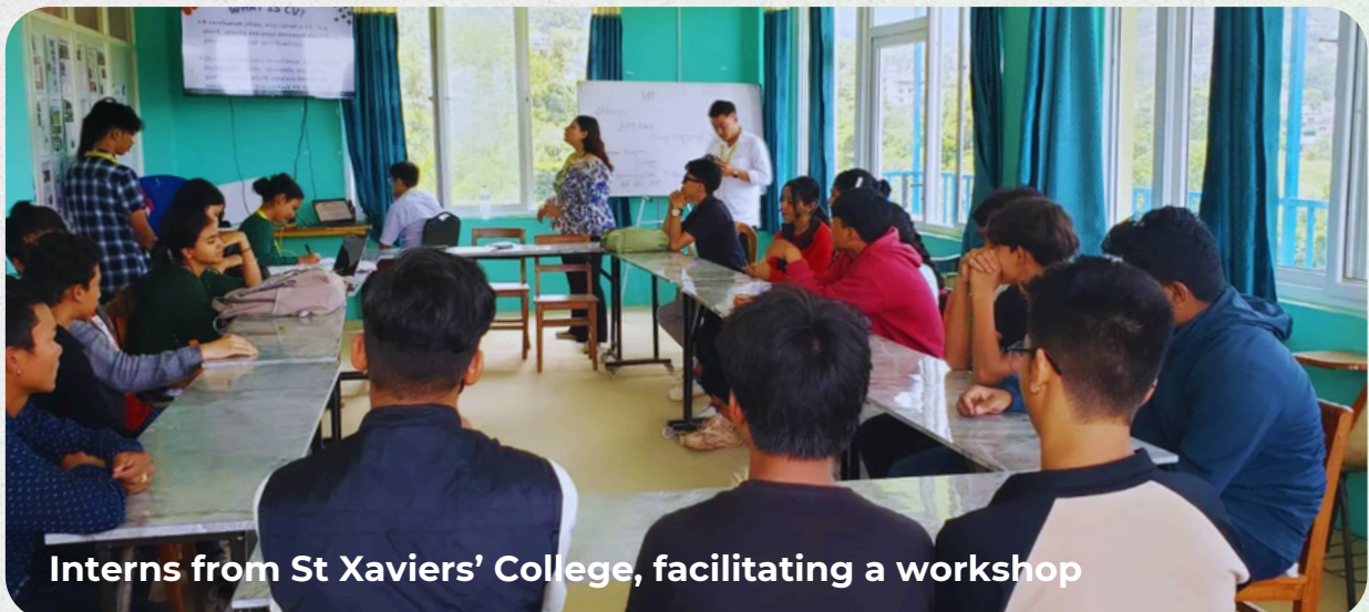
Interns from St Xaviers' College, facilitating a workshop

The interactive sessions offered practical insights and techniques to help students build strong resumes, enhance their communication, and develop leadership qualities—skills crucial for their future success.