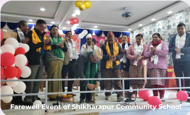
Farewell Event of Shikharapur Community School