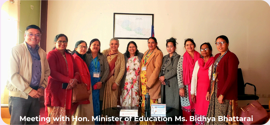
Meeting with Hon. Minister of Education Ms. Bidhya Bhattarai