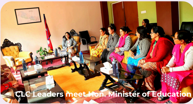
CLC Leaders meet Hon. Minister of Education